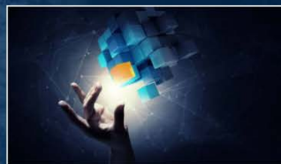
2022 Winners Inspiration - Innovation - Impact ▶