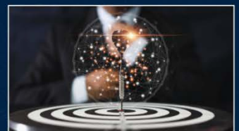
2024 Winners Partnerships - Digital - Sustainable and inclusive ▶